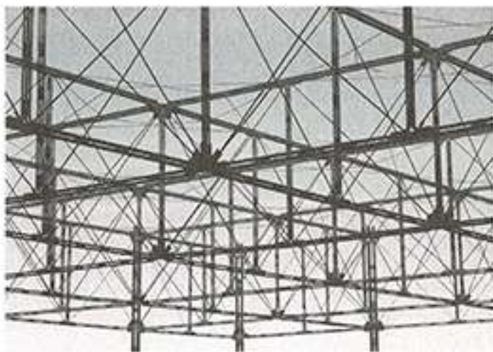
Above: Estudi d'Arquitectura Toni Gironés, revamping the natural archaeological site of Can Tacó, Montmeló-Montornès del Vallès, Barcelona, Spain, 2012. Photo Aitor Estévez Below: Estudi d'Arquitectura Toni Gironés, The Museum of Climate, Lleida, Spain, 2015. Photo Beatriz Morales López (Estudi d'Arquitectura Toni Gironés)